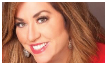
By Lisa Moler

S LEEP. It's our escape, our refuge, our fountain of youth, our everything ... well, except when it's NOT.